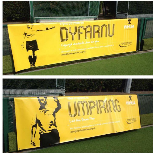
Cup finals pitch side banners