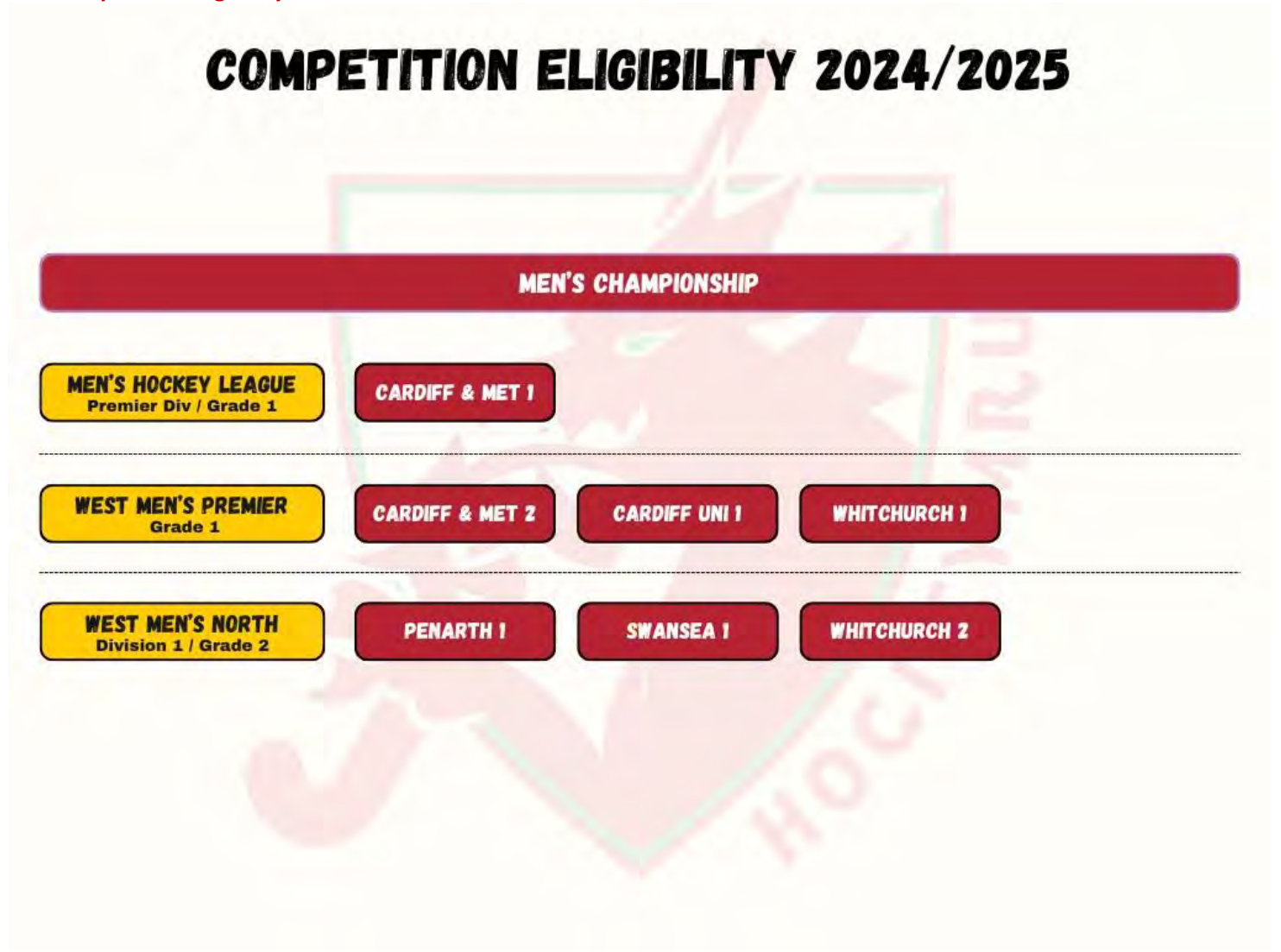
Appendix 1 – Senior Competition Eligibility